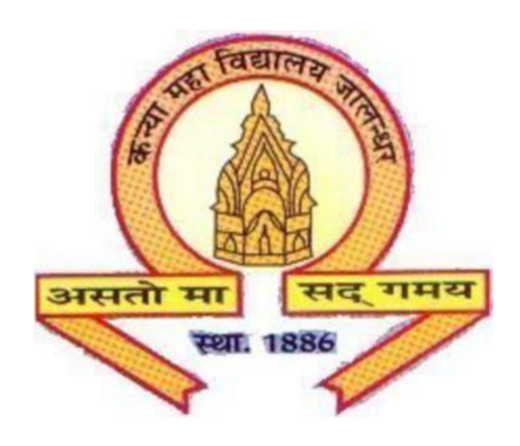
The Heritage Institution KANYA MAHA VIDYALAYAJALANDHAR (Autonomous)