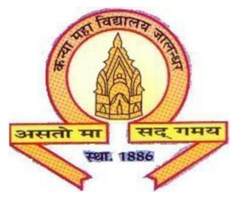
The Heritage Institution KANYA MAHA VIDYALAYAJALANDHAR

(Under Credit Based Continuous Evaluation Grading System) (Session: 2022-2023)