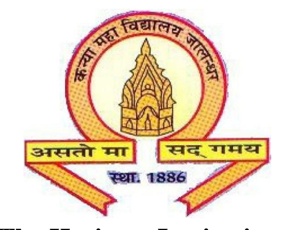
The Heritage Institution