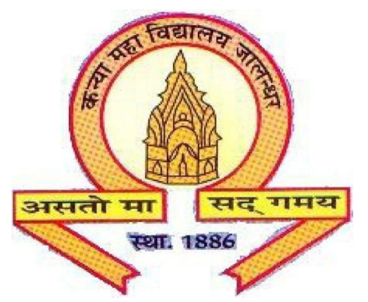
The Heritage Institution