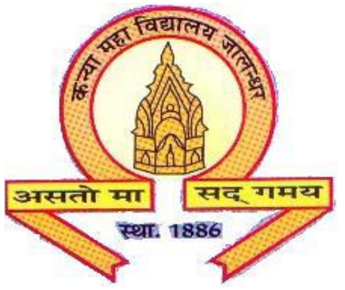
The Heritage Institution