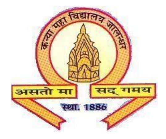
The Heritage Institution

KANYA MAHA VIDYALAYAJALANDHAR (Autonomous)