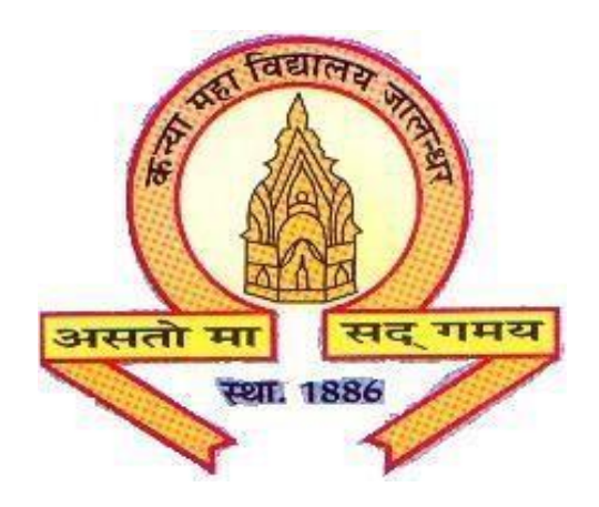
The Heritage Institution

KANYA MAHA VIDYALAYAJALANDHAR (Autonomous)